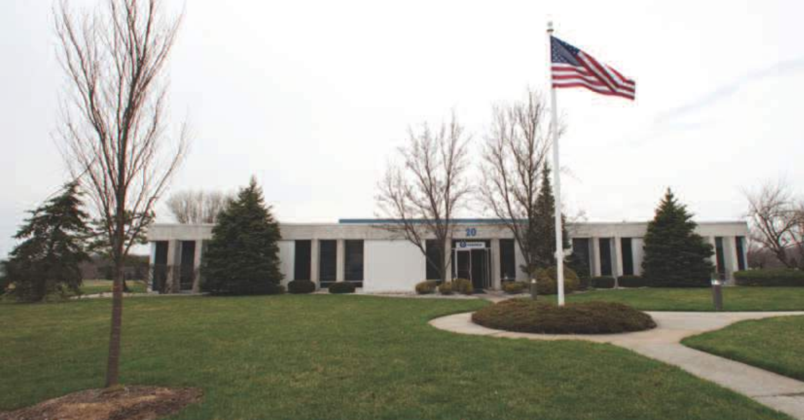
One of the several research facilities of Sabinsa Corporation at USA.

into Kerala market. Backed by over 113 US and international patents, the Company has strong credentials and market leadership in the fast growing global dietary supplement market. The Company plans to introduce a comprehensive range of nutraceuticals including both, dietary supplements as well as functional foods and beverages besides a slew of high-end, natural personal care products and cosmeceuticals. "We are not selling something from foreign soil claiming that it can cure all disease. The products of Sami Direct are clinically proven and documented. The products are well accepted by the developed world market; Americans, Europeans and the Japanese. Other products today available claim effectiveness but not many have been clinically proven. On the contrary if we want to put a product on the list we will first complete its clinical documentation and then only we will make it available in the market," says Dr. Majeed.